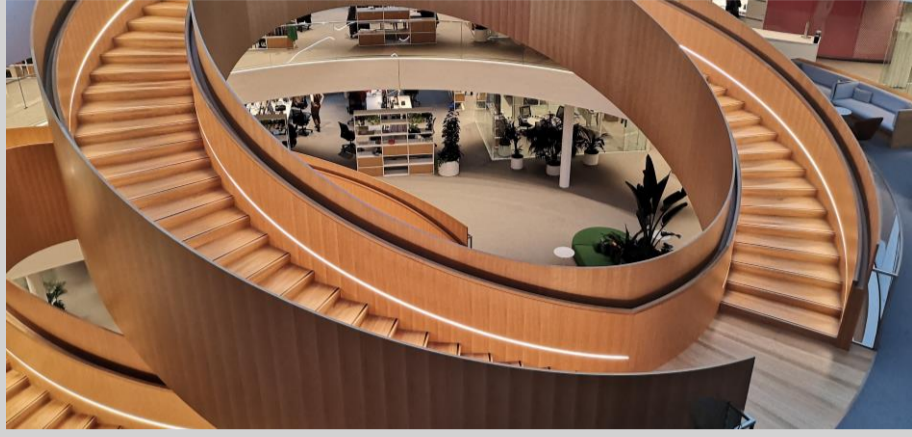
Stairs at IOC: IOC and world sports