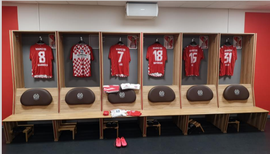
Football: MEWA-Arena 1. FSV Mainz 05